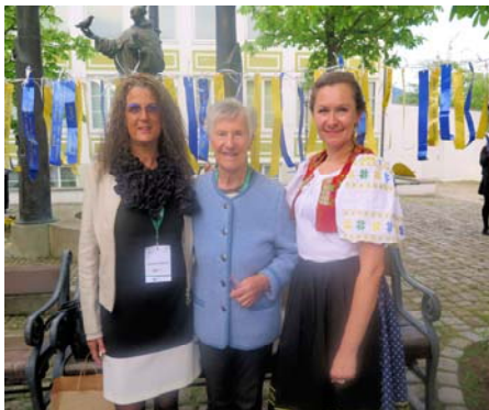
Bellagio Sherborne and Zvolen

There were over 30 teachers in the Education Conference, Most groups had a poster presentation based upon 'refugees in the community' A teacher from Hungary explained that his country was building a wall to keep out the refugees. Other countries were keen to keep the migrants because of depopulation.