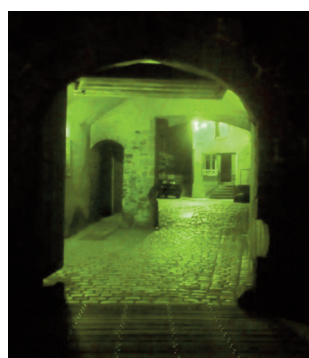
Leweston Chapel, Sherborne