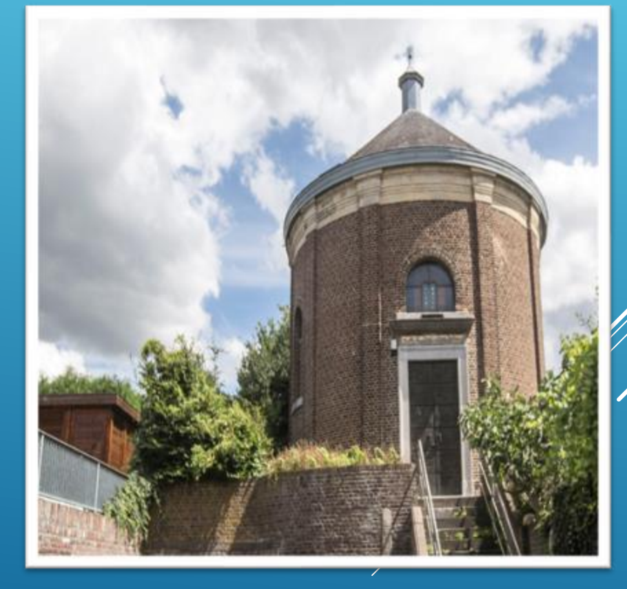
Meerssen Jewish synagogue

From September 28 to October 1, 2023 the annual meeting of Douzelage Europa was held in Rovinj, our partner city in Croatia. More than 150 participants from all over Europe gathered to discuss the topic: Cultural Heritage. Each partner city had made a significant contribution.