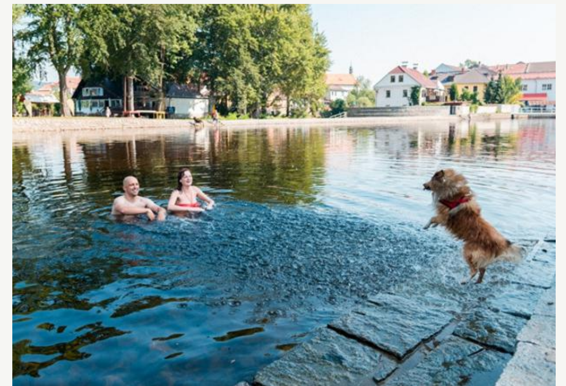
Outdoor swimming area Fuferna on the river Otava