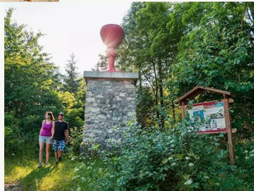
The Calyx on Žižka Hill