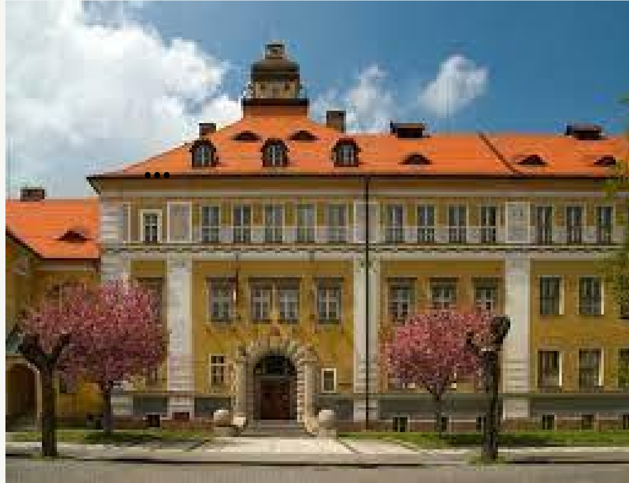
Gymnázium Sušice (grammar school)