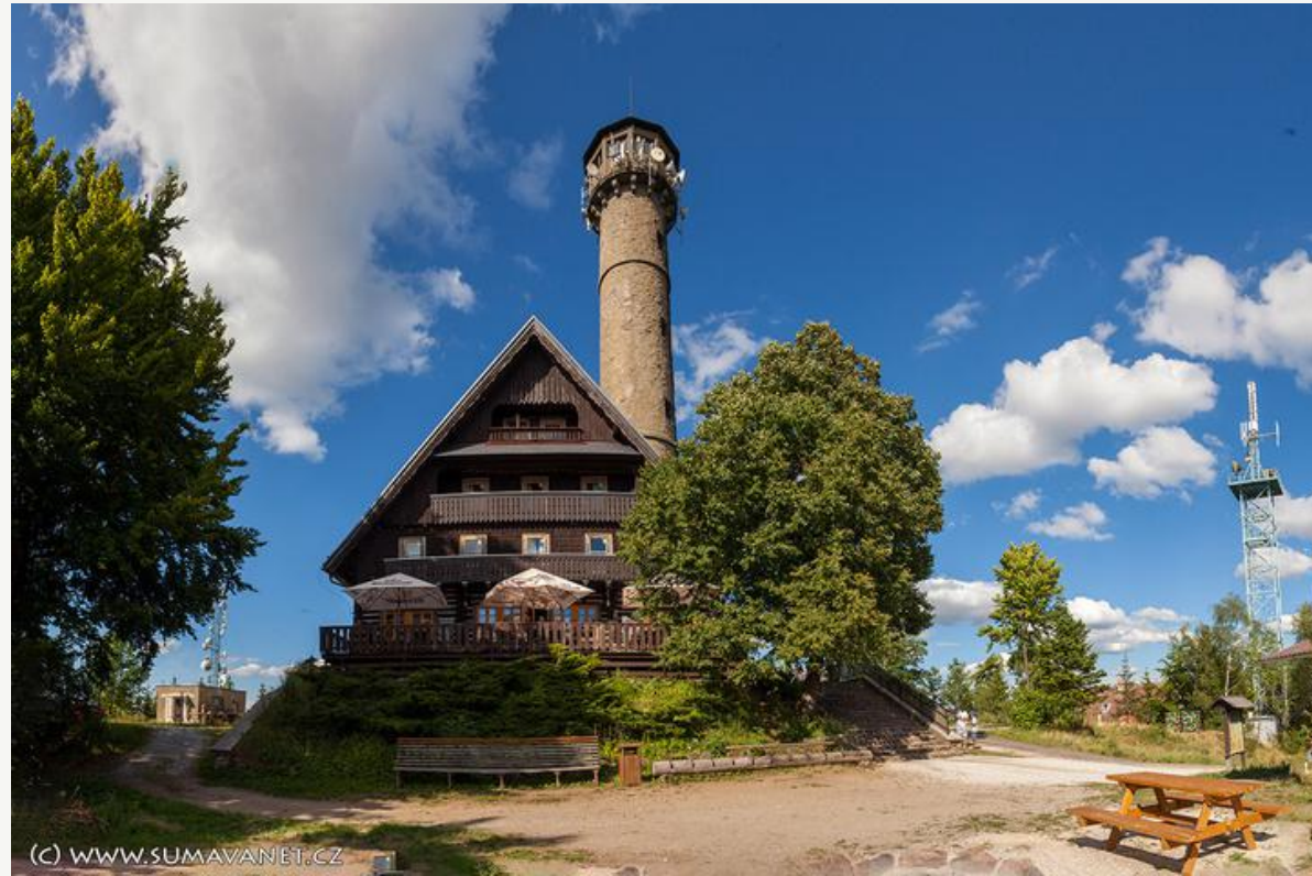
Svatobor watch tower