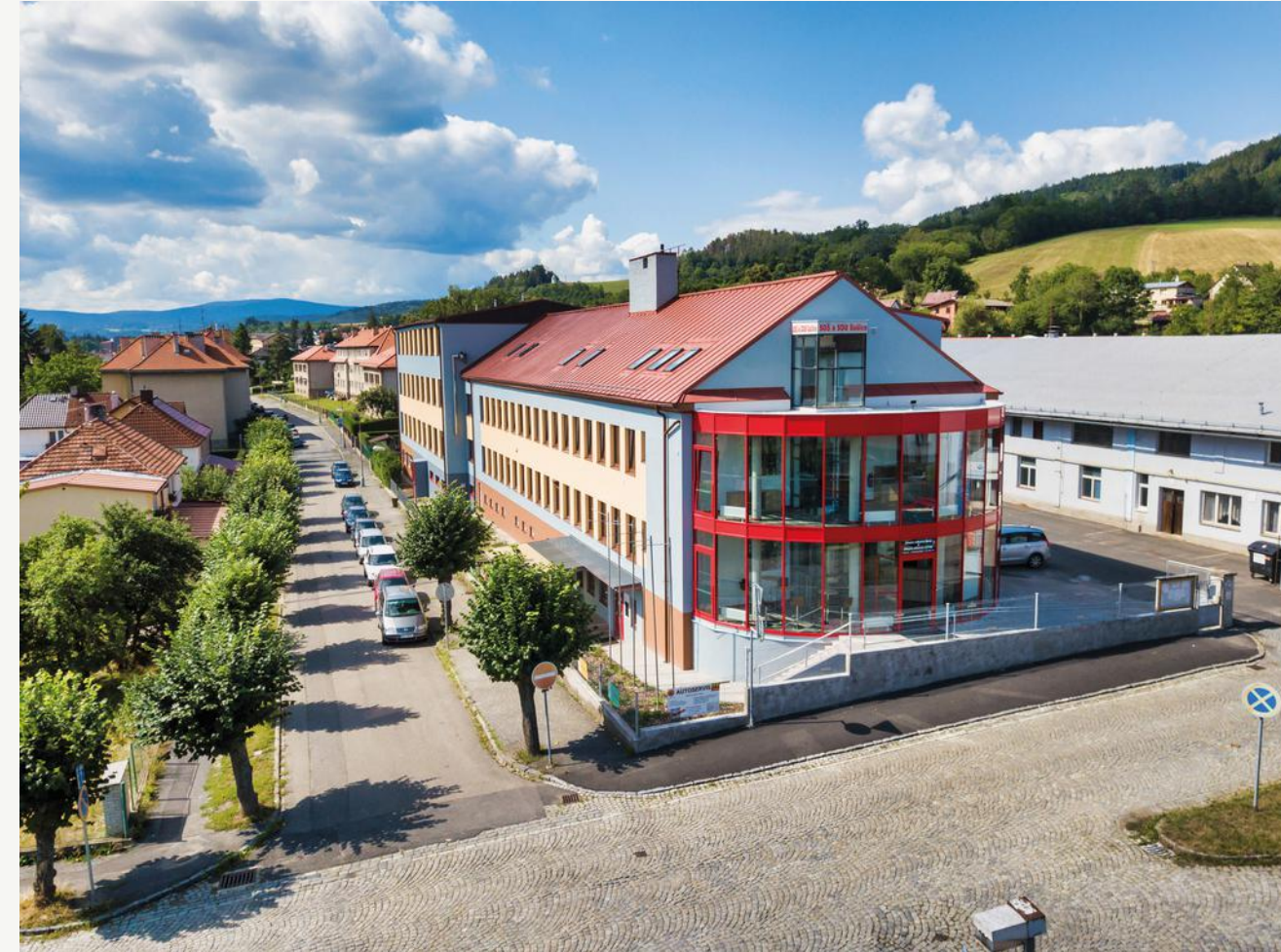
Vocational School Sušice