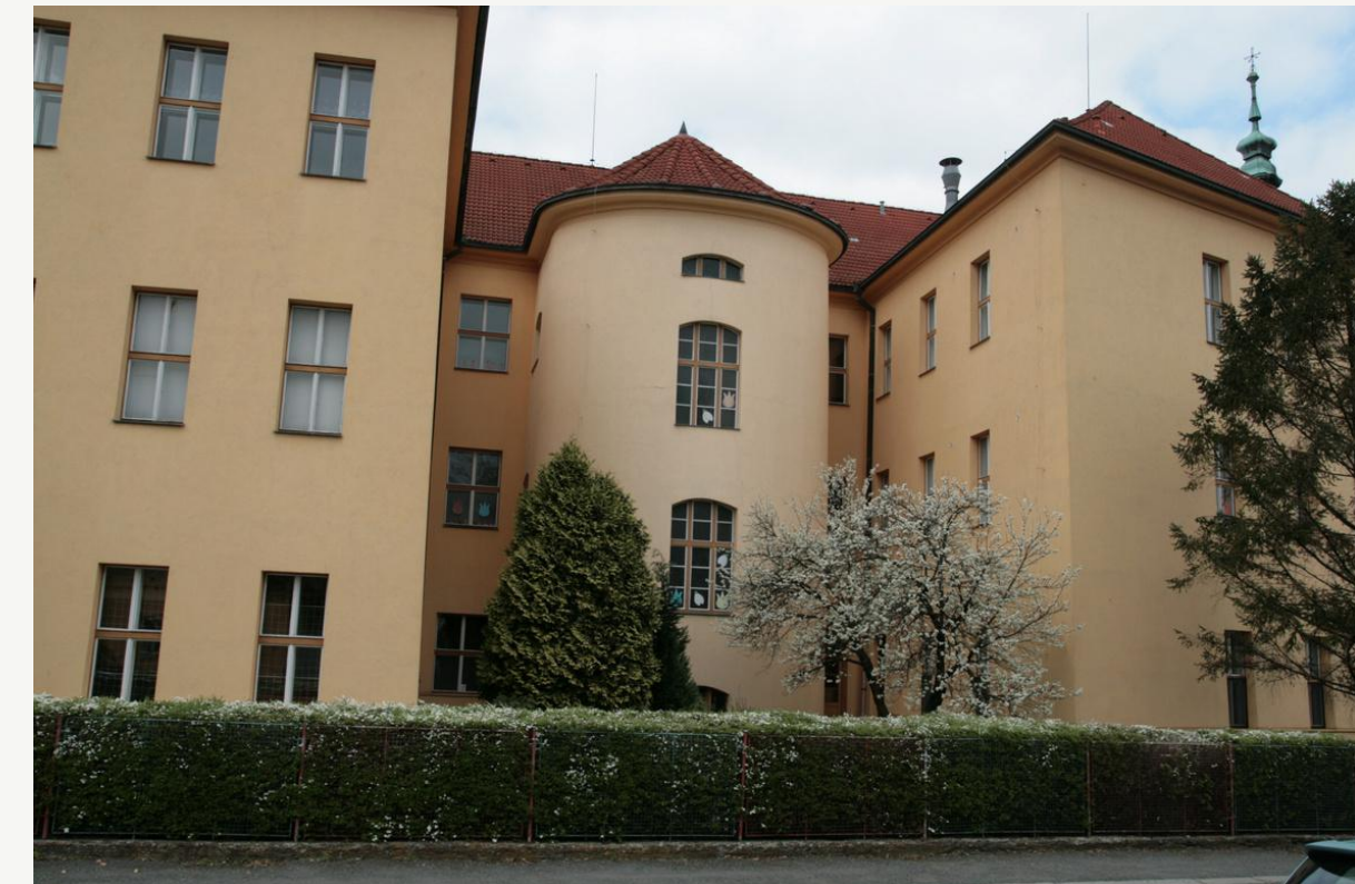
Komenského Primary School