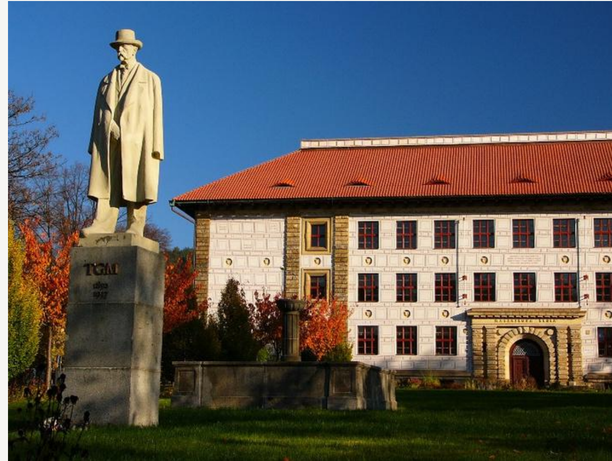
Masarykova Primary School