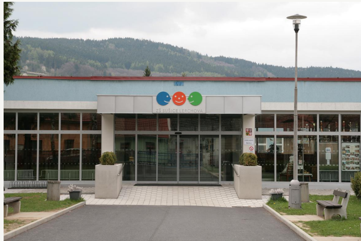
Lerchova Primary School